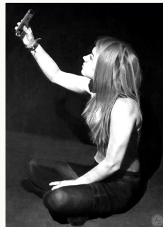
I Have 400 Friends and I Am Lonely (II) charcoal on paper 84 x 59cm