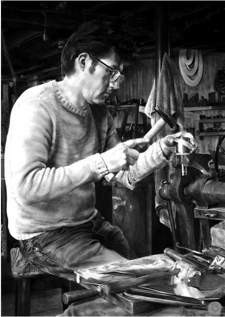
GofH Silversmith , charcoal on paper, 84 x 59cm