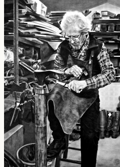
The Blockley Cobbler charcoal on paper 84 x 59cm

True Grit brings this body of work together at a moment when its quiet insistence feels especially necessary. It is not a loud exhibition. It is a lasting one.