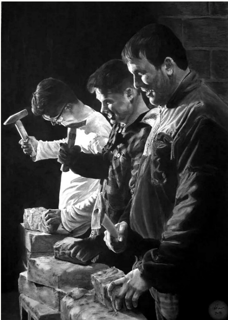
Hard Labour , charcoal on paper, 84 x 59cm

John Davies Gallery presents True Grit: Kevin Line's People of the Cotswolds , bringing together 44 charcoal paintings by Kevin Line PS . It is the artist's first significant solo exhibition and runs from 27 June to 5 September 2026 . Works range from £1,950 to £4,400 .